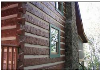
Custom 6x12 Log Home with Edge Chamfer for a rustic Antique look.

In this ever evolving culture that is Log, Timber Frame & Hybrid Homes, Wood House Construction, Inc. strives to stay on the cutting edge. Wood House Homes formerly Brentwood Log Homes is poised more than any company in this field to take the lead role in providing its customers with the best in material